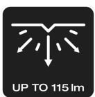
Up to 115 Lumen