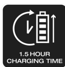
Approx. 1.5 hours charging time