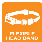
Flexible Head Band